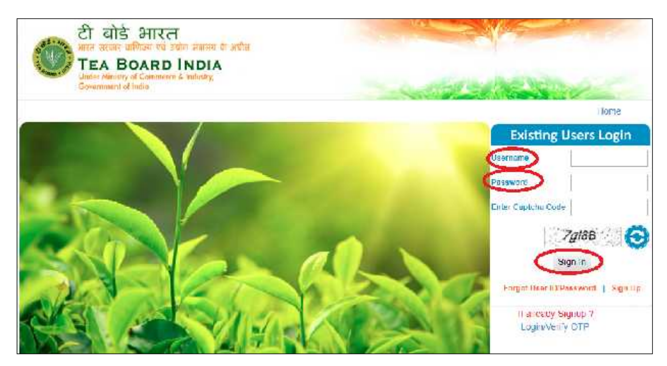
Note: - In case of FORM-E returns User has to use the login credentials as used in the current FORM-E system, however there is a minor change in the User ID as the special characters could not be included in the eGiCCS system due to security audit hence Users has to use their user ID without any special character.

For instance please check the difference in existing and new User Id in the examples mentioned in table below: